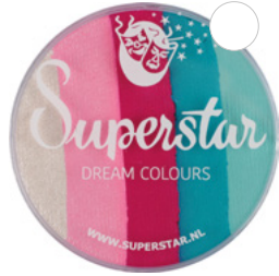
139-85.903: Ice cream